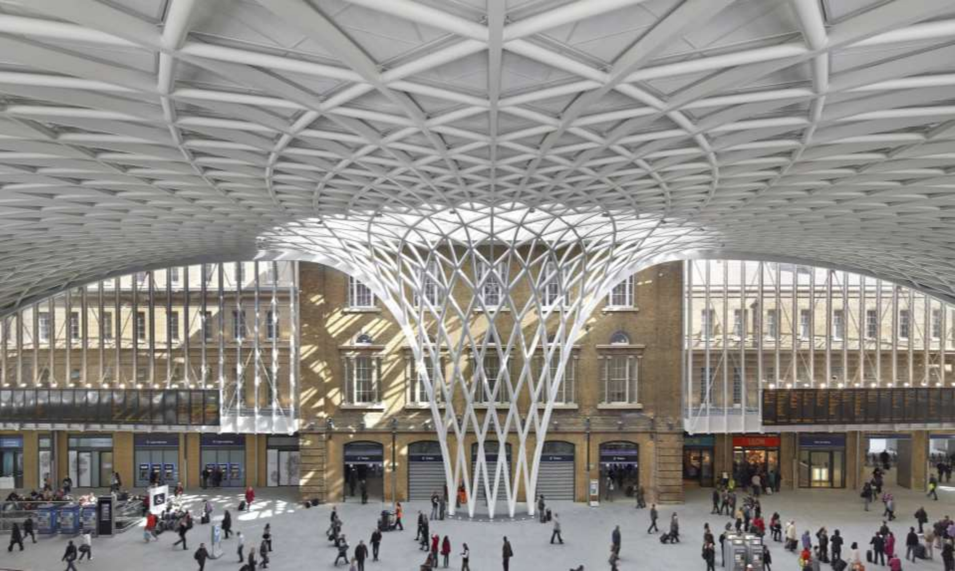
Credit: King's Cross Redevelopment: John McAslan + Partners, Architects